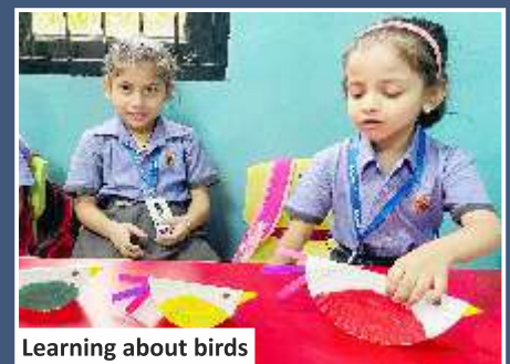
Learning about birds