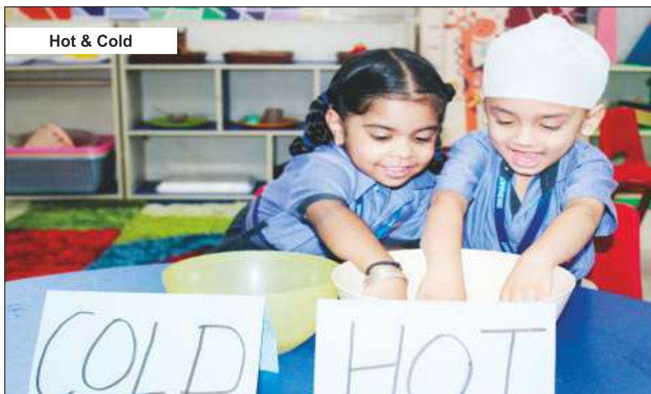
Hot & Cold