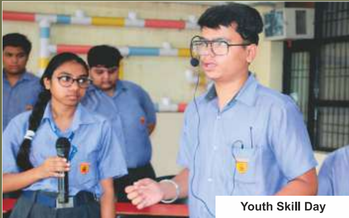
Youth Skill Day

World Youth Skill Day was celebrated at the campus to make students aware of the skills required for employment, decent work, and entrepreneurship in coming times. Students of Grade X presented a short skit highlighting the necessity of equipping youth with such skills and agencies working for the same. The main attraction of the assembly was the musical performance that emphasized enhancing creative and other entrepreneurial skills.