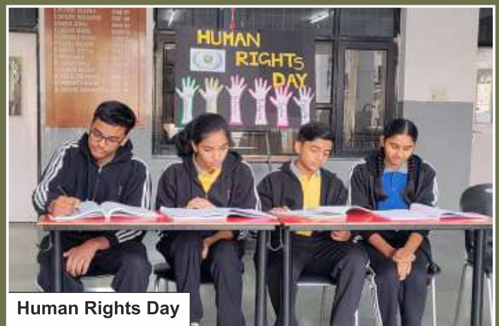
Human Rights Day

Students of Grade VIII presented a special assembly on National Energy Conservation Day, sensitizing their schoolmates on adopting different ways to conserve energy like replacing light bulbs with LEDs, usage of smart power strips, use of solar energy, etc. They also raised a few slogans highlighting the message of doing something good for the planet.