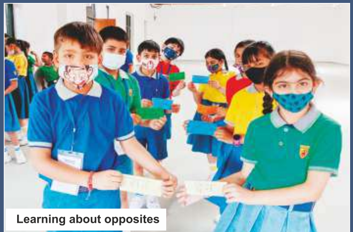
Learning about opposites