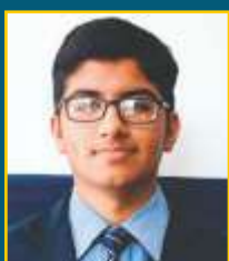
Arpit Science - 93.6%