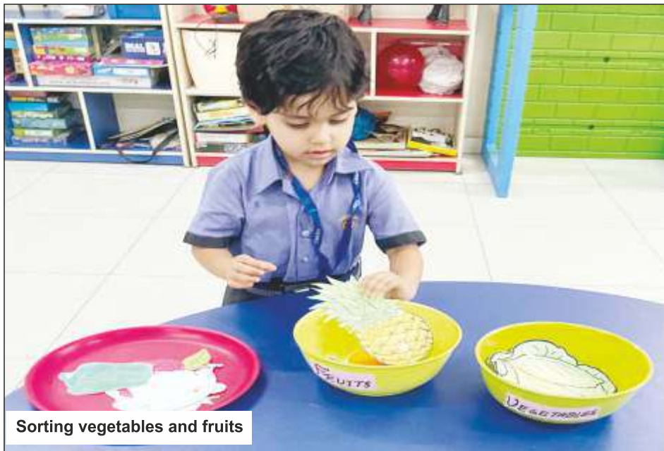
Sorting vegetables and fruits