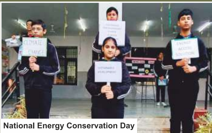
National Energy Conservation Day

Future generations would find it difficult to accept that a saint once lived, who achieved his country's liberation via only non-violent means. Paying homage to the great Indian soul Mahatma Gandhi, students of Grade V conducted a special assembly. They presented an act that was a perfect blend of theatre and music, highlighting his contribution to India's liberation.