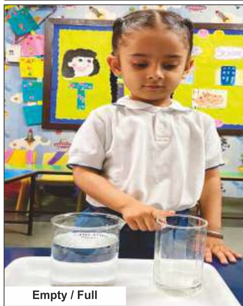
Empty / Full