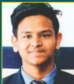
Jigyasu Science - 98%