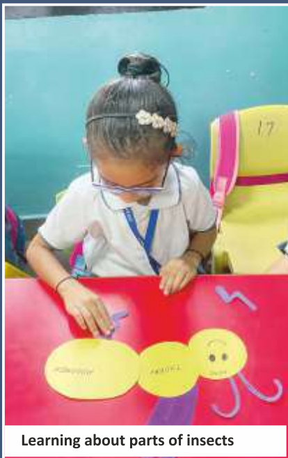
Learning about parts of insects