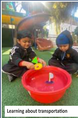
Learning about transportation