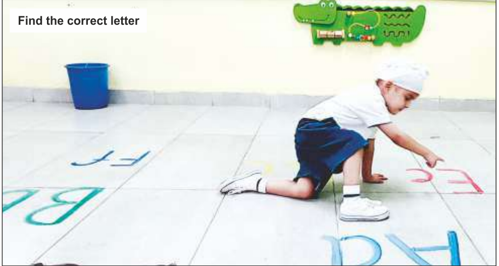
Find the correct letter