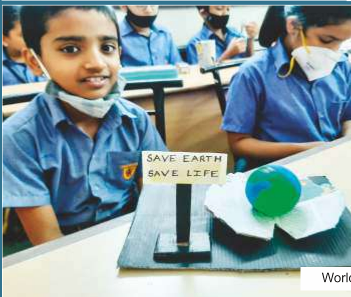
World Earth Day