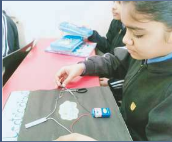
Making of electrical circuit and testing of conductors and insulators.