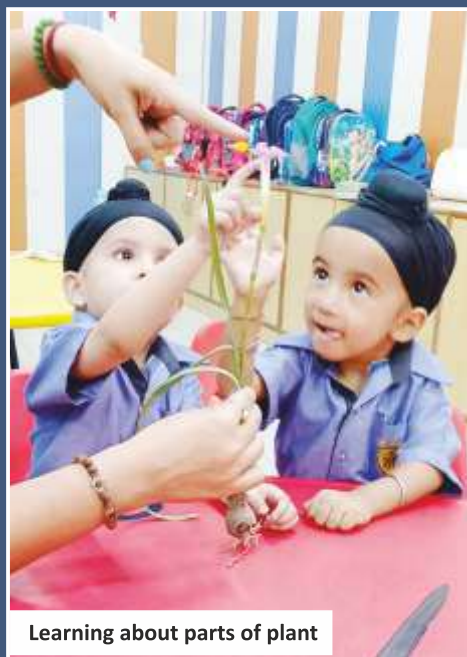
Learning about parts of plant