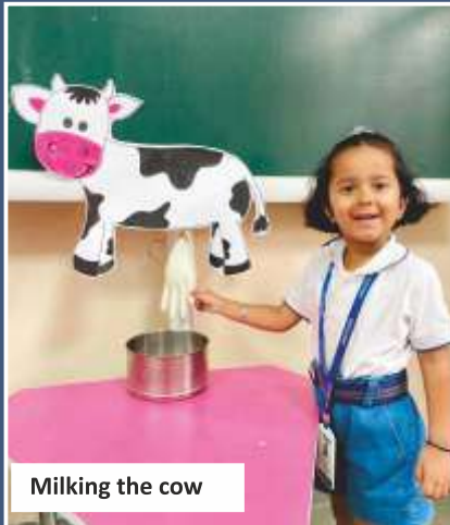
Milking the cow