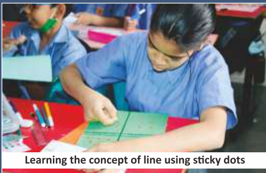
Learning the concept of line using sticky dots