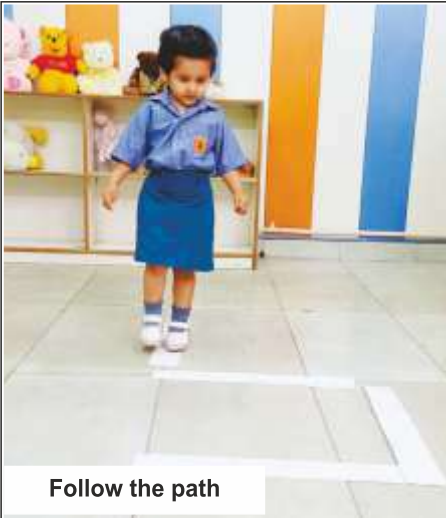
Follow the path