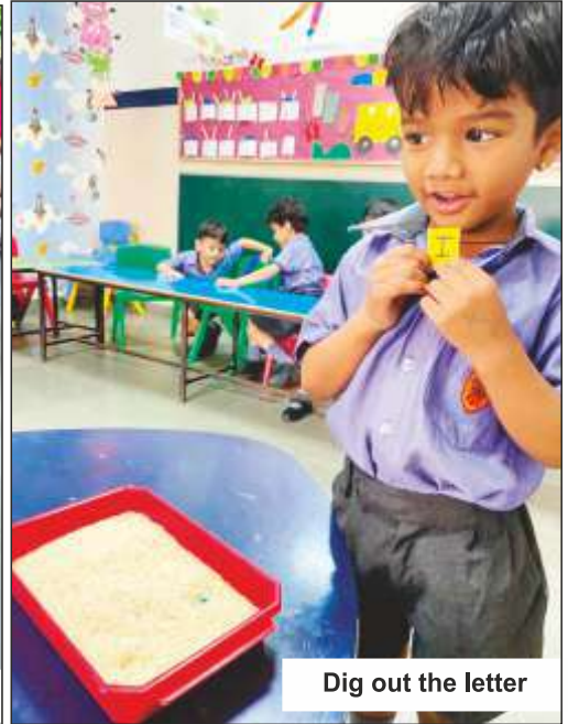
Dig out the letter