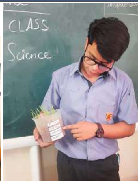
Showcasing soil profile