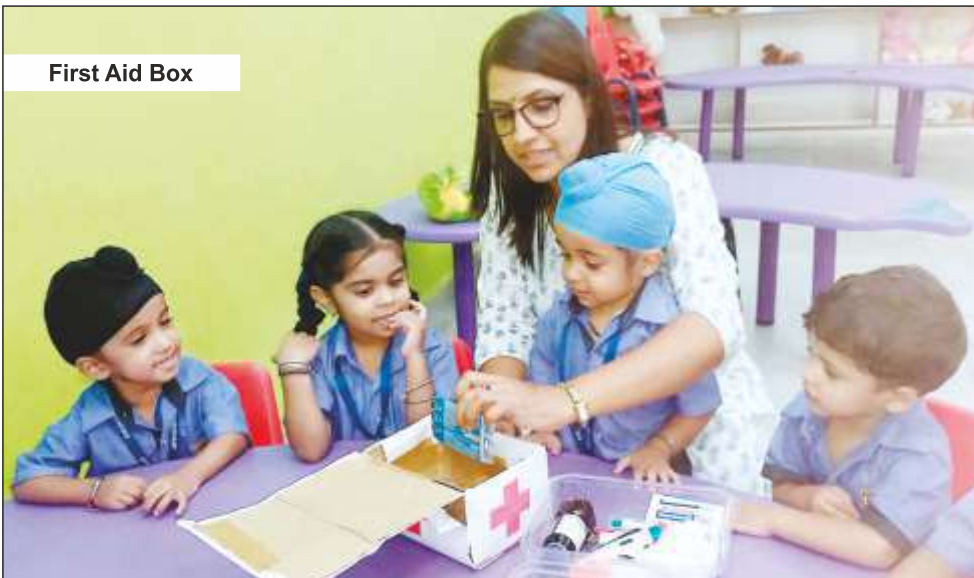
First Aid Box