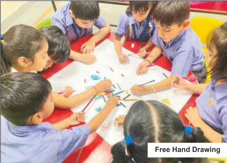
Free Hand Drawing