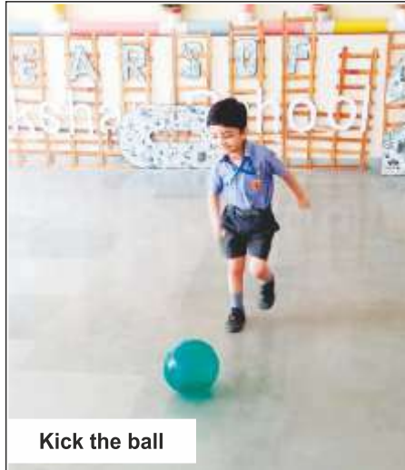
Kick the ball