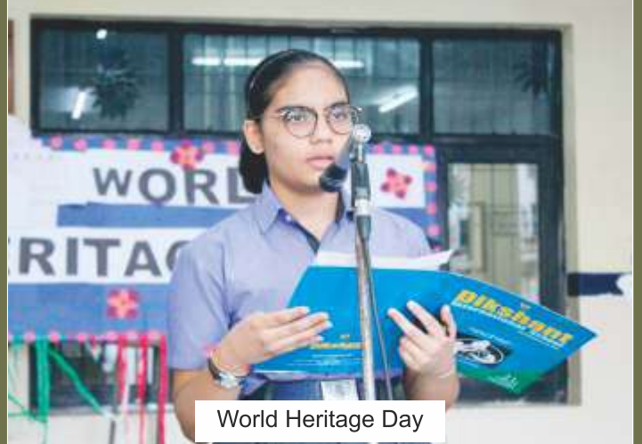
World Heritage Day

Dance is a form of expression, a way of speaking one's mind through music. It not only allows you to express your thoughts and feelings but also keeps you physically fit and sound for life. On the occasion of International Dance Day, our students from the middle school presented a special assembly wherein they performed a medley of dance styles.