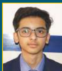
Sakaar Science - 93.6%