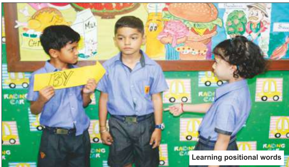
Learning positional words