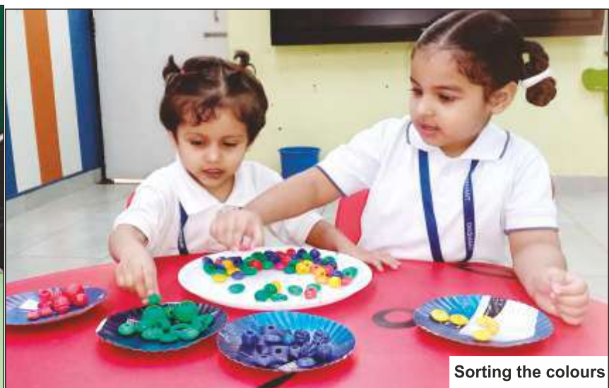
Sorting the colours