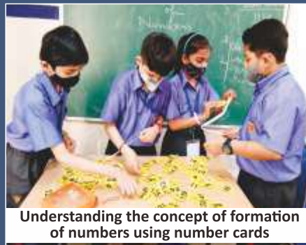
Understanding the concept of formation of numbers using number cards