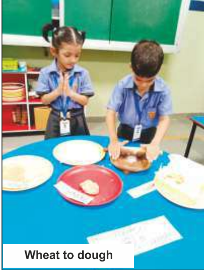
Wheat to dough

Life skills help children to become independent and prepare them for different stages of life. Students are trained for some basic life skills like setting up their own meals, basic grooming and cooking, dressing and undressing etc. in their formative years. It allows them to feel empowered, independent and helps develop their self-esteem.