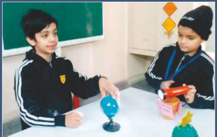
Formation of Day & Night