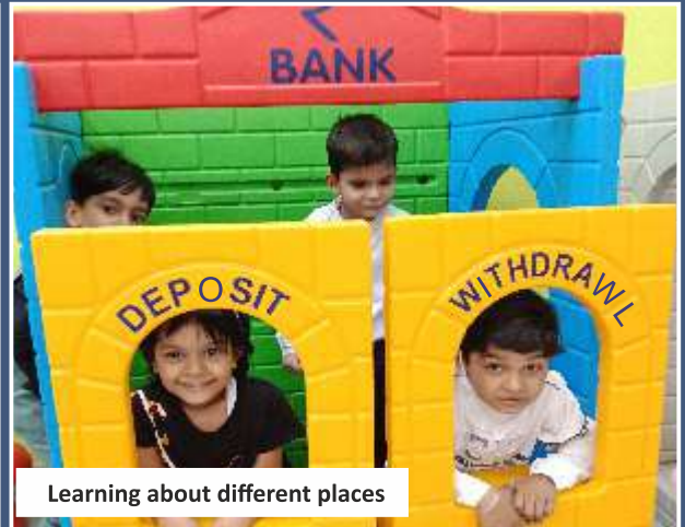
Learning about different places