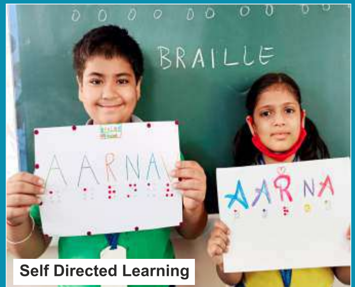
Self Directed Learning