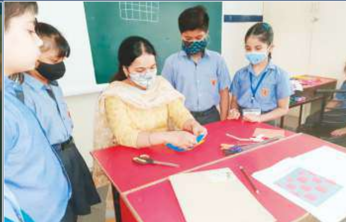
Concept of weaving