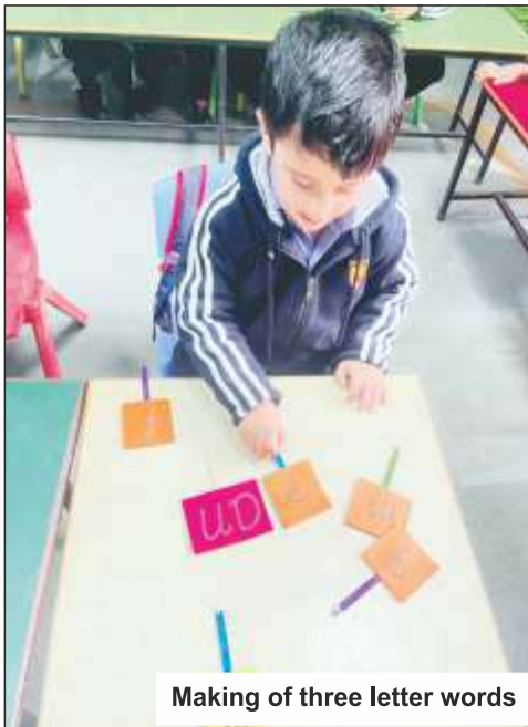
Making of three letter words