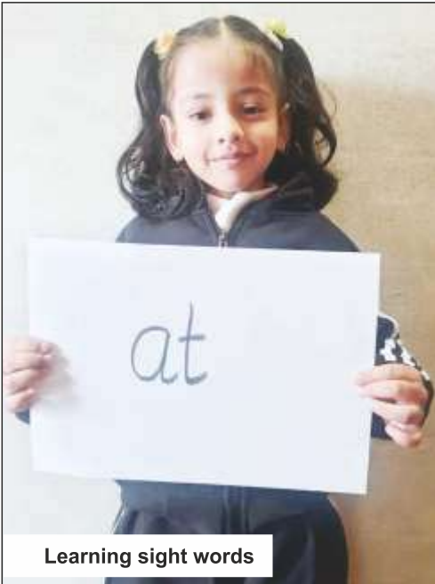
Learning sight words