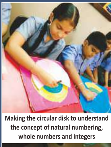
Making the circular disk to understand the concept of natural numbers, whole numbers and integers