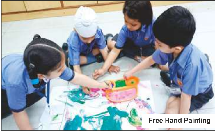
Free Hand Painting