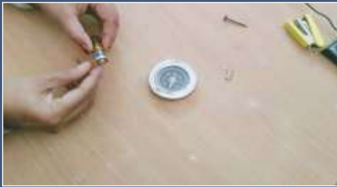
Making of electromagnet and checking out the deflection in magnetic compass