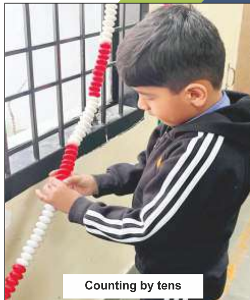
Counting by tens