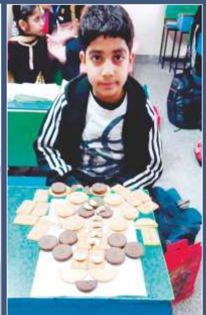
Learning about Shapes