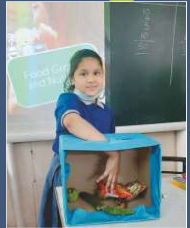
Identifying food nutrients