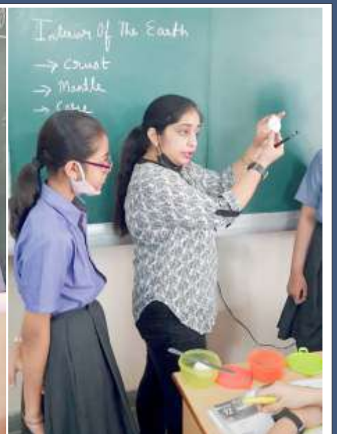
Learning about different layers of earth using egg as a source