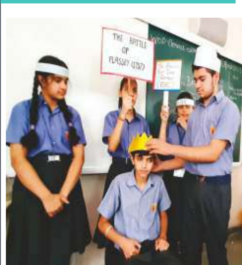
Students inacting an important event in History 'The battle of Plassy'