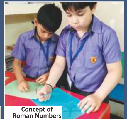
Concept of Roman Numbers