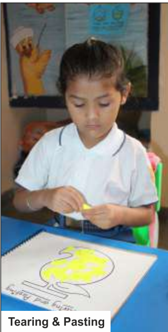
Tearing & Pasting