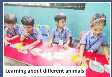
Learning about different animals