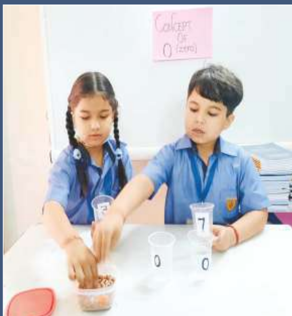
Concept of Zero