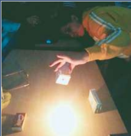
Making of pinhole camera