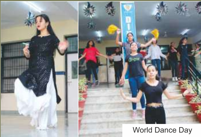
World Dance Day

World Health Day is a global health awareness day, celebrated every year on the 7th of April. This year's celebrations were around the theme 'Our Planet, Our Health' which lays attention on urgent actions needed to keep humans and the planet healthy and foster a movement to create societies focused on well-being. A special assembly was held at the campus to highlight the importance of keeping ourselves as well as our planet healthy. The highlight of the assembly was the Zumba session, a high-intensity dance workout organized by students of Grade X and VIII. It was amazing to see the students from all the classes participate with full enthusiasm in the session.