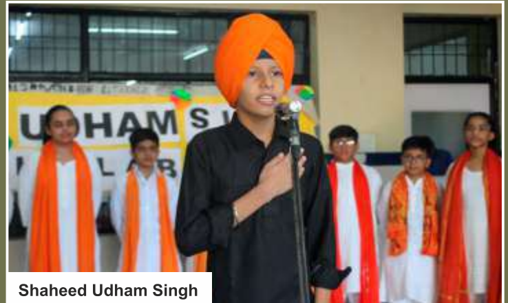
Shaheed Udham Singh

World Youth Skill Day was celebrated at the campus to make students aware of the skills required for employment, decent work, and entrepreneurship in coming times. Students of Grade X presented a short skit highlighting the necessity of equipping youth with such skills and agencies working for the same. The main attraction of the assembly was the musical performance that emphasized enhancing creative and other entrepreneurial skills.