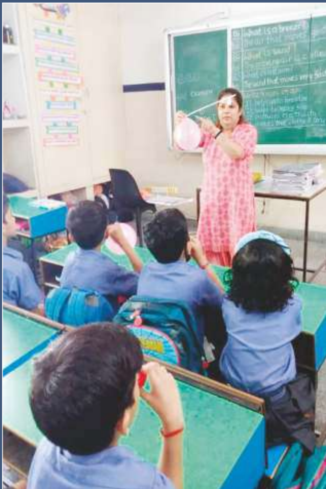
Concept of Air