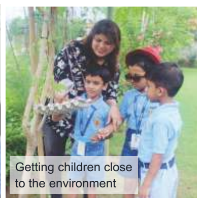
Getting children close to the environment