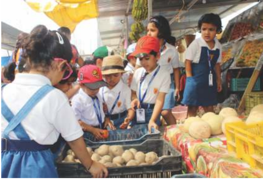
As a part of the theme 'Food', students of kindergarten visited the local fruit and vegetable market where they identified different kinds of fruits and vegetables and understood their importance for one's health.