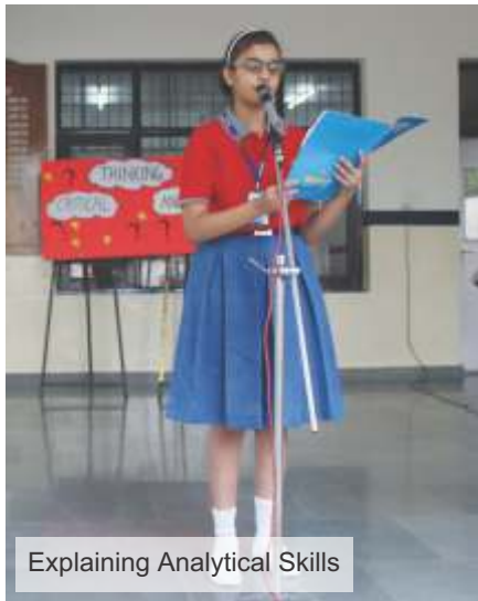
Explaining Analytical Skills