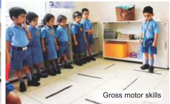
Gross motor skills