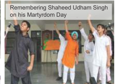
Remembering Shaheed Udham Singh on his Martyrdom Day