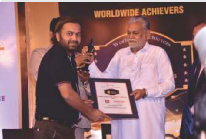
Best School with Academic Excellence in Punjab International School Awards 2018