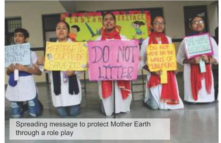
Spreading message to protect Mother Earth through a role play