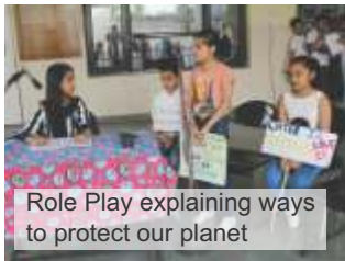
Role Play explaining ways to protect our planet