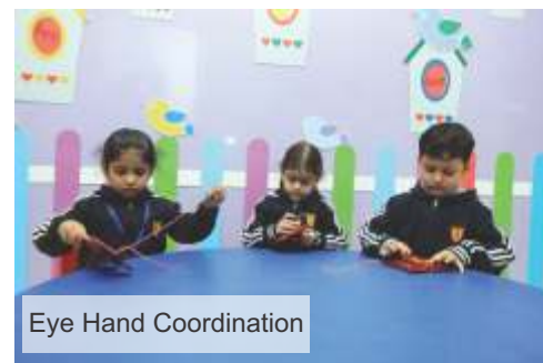
Eye Hand Coordination

To accelerate emotional, social, motor and cognitive learning through the pleasure of play, a spacious indoor play area has been developed in the kindergarten wing. The room with brightly coloured walls is well equipped with tools including sand pits, cognitive tools on walls, trampoline, sea-saw, puzzles, toys and virtual play stations to teach children about practical life in a lively atmosphere.