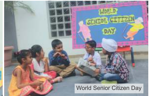
World Senior Citizen Day