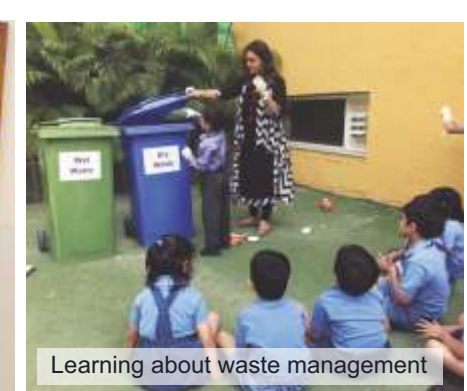
Learning about waste management