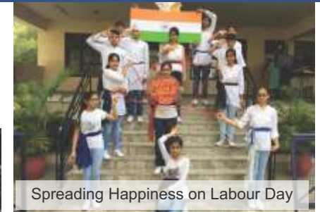
Spreading Happiness on Labour Day