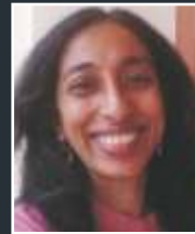
Devika Rangachari Historical Fiction