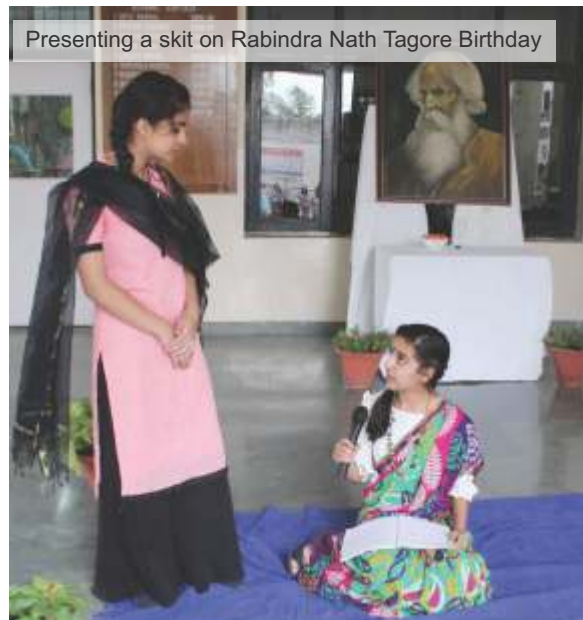
Presenting a skit on Rabindra Nath Tagore Birthday