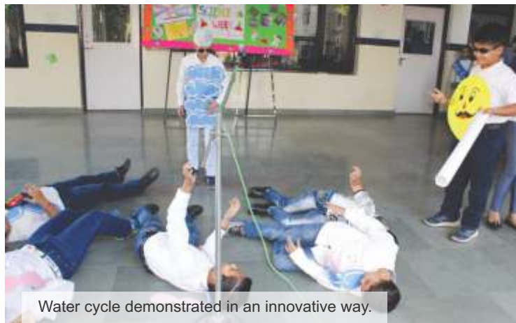
Water cycle demonstrated in an innovative way.

India, one of the world's oldest civilizations gave to the world, the concept of Zero, Yoga, Ayurveda and more. Enchanting India is a treasury of art, architecture, philosophy, mythology, dance, music, diverse culture and civilizations. In an attempt to make our students aware of this treasure, 'Heritage Week' was celebrated at the campus from 19th November to 25th November, 2018. As a part of the celebration, students presented play, skits, had discussions and learnt the importance of our heritage and how to conserve our legacy.