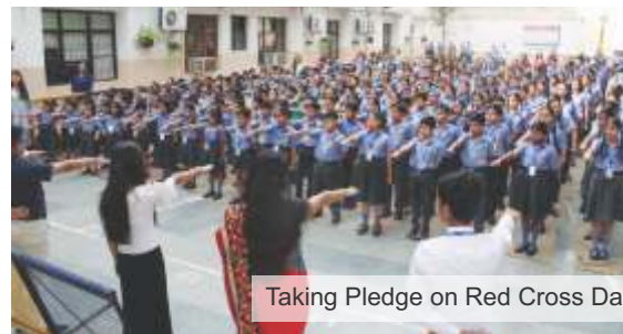
Taking Pledge on Red Cross Day