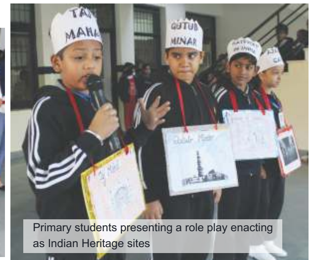
Primary students presenting a role play enacting as Indian Heritage sites