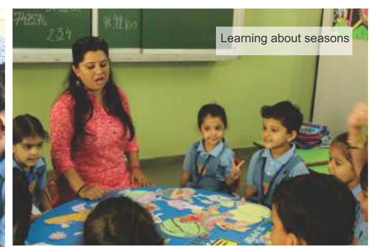
Learning about seasons