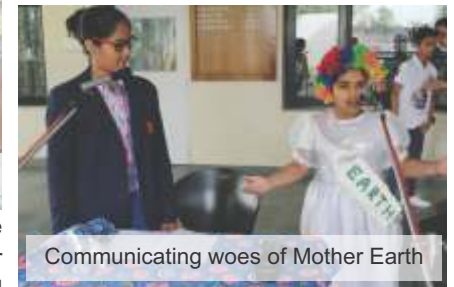
Communicating woes of Mother Earth