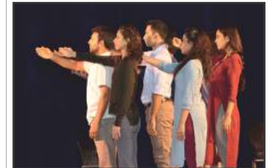
'Blank Page' - An Interpretation of contemporary Indian poetry through theatre, music and movement by Tamaasha Theatre Group, Mumbai