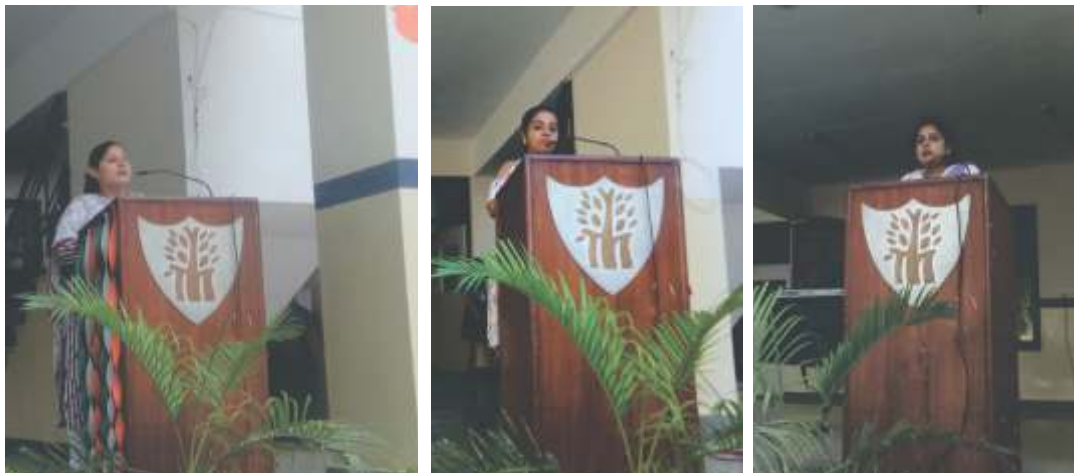
Teacher as a role model for promoting reading

At Dikshant, we believe that books are a treasure trove of knowledge that lead to curiosity, creativity, imagination, exploration, and finally enthusiastic learners. Continuing with our endeavor to inculcate the values and joy of reading in children from the early years, primary wing of school celebrated Literula Week from 14th to 19th May 2018 . The six day event comprised a host interesting activities for the children including story telling sessions by teachers, parents and grandparents. They also indulged in discussions on respecting, sharing and taking care of books. Students also visited the library specifically to understand the importance of library, rules to be followed and making book marks. They watched movies and narrated stories in assembly using finger puppetry. The week ended with Character Parade Competition where they enacted different characters from the stories read by them.