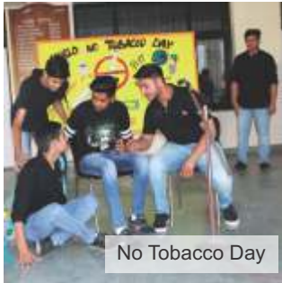
No Tobacco Day