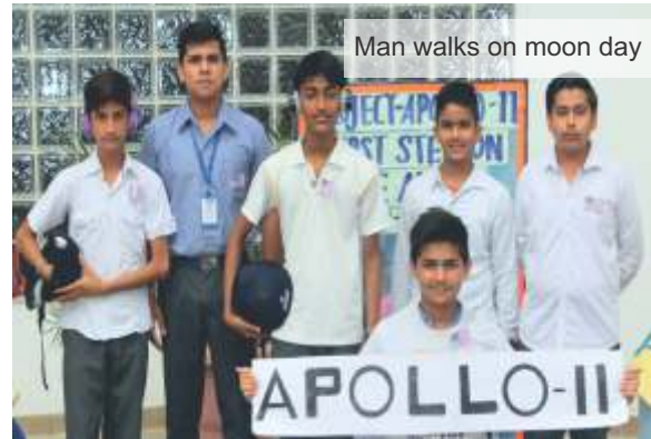
Man walks on moon day