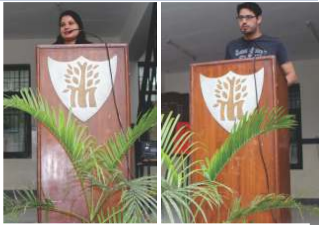
Building a community that reads