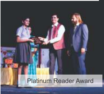
Platinum Reader Award