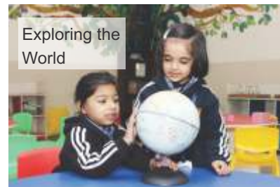
Exploring the World