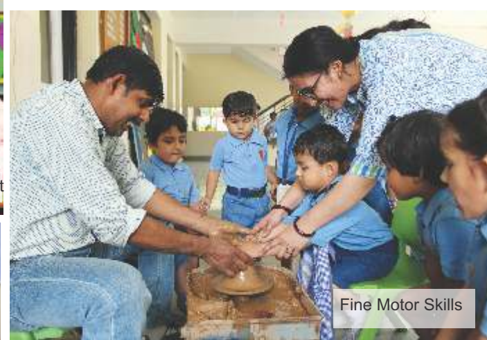
Fine Motor Skills