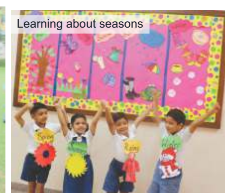
Learning about seasons