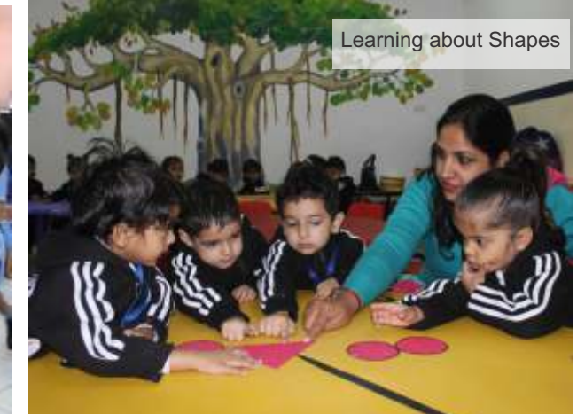
Learning about Shapes