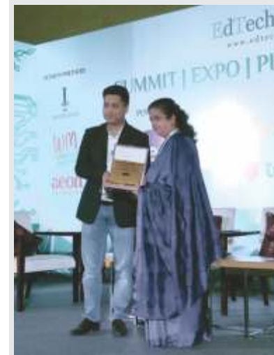
EdTech Savy School of the Year Award 2018