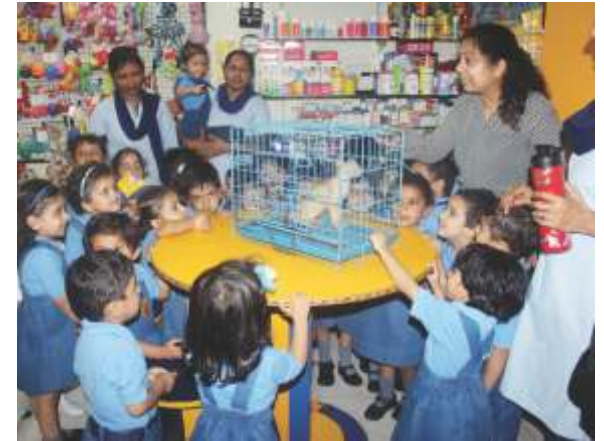
Visit to a pet shop