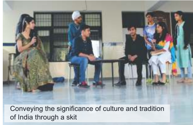
Conveying the significance of culture and tradition of India through a skit

Science week was celebrated in school from 12th to 18th November, 2018. The aim of celebration was to involve students in global scientific perspective and to make them understand how science impacts their daily lives. During the week, information flowed in the form of charts, boards decorated all over the school building. Week long activities provided students of all classes with an opportunity to present their perspective about different scientific fields in the form of discussions, debates, role plays, quizzes, experimentations in assembly as well as classrooms.