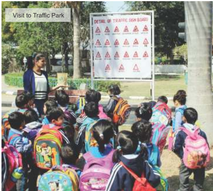
Visit to Traffic Park