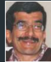
Ranjit Lal Animal Stories