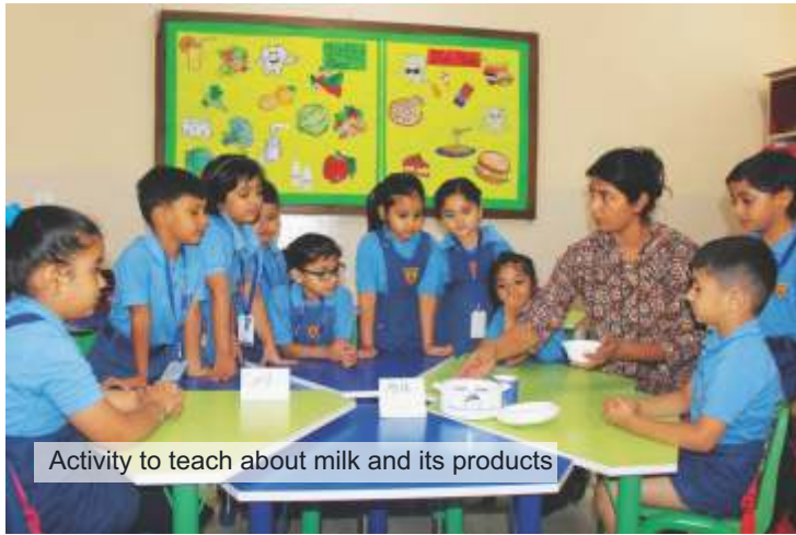
Activity to teach about milk and its products