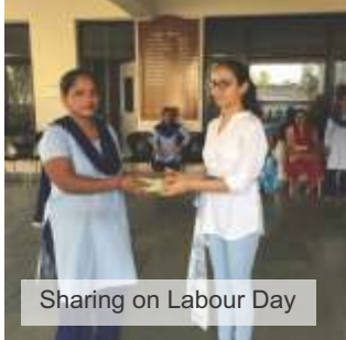
Sharing on Labour Day