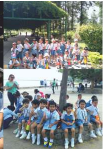
The tiny tots of Kindergarten went on a Hop on - Hop off trip. The kids explored places like Bougainville Garden, Sukhna Lake and Rose Garden.