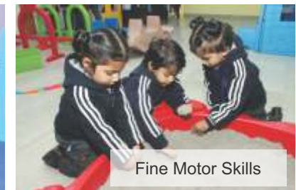
Fine Motor Skills

To accelerate emotional, social, motor and cognitive learning through the pleasure of play, a spacious indoor play area has been developed in the kindergarten wing. The room with brightly coloured walls is well equipped with tools including sand pits, cognitive tools on walls, trampoline, sea-saw, puzzles, toys and virtual play stations to teach children about practical life in a lively atmosphere.