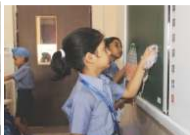
Training students to maintain hygiene and cleanliness