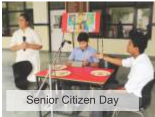
Senior Citizen Day