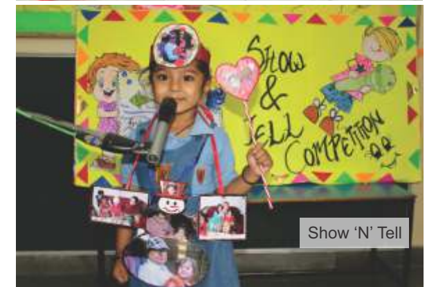
Show 'N' Tell