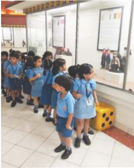
Students of nursery visited the International Doll Museum located at Bal Bhavan, Sector 23, Chandigarh.