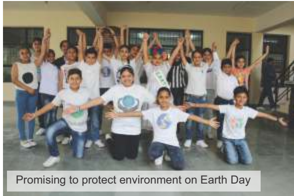
Promising to protect environment on Earth Day