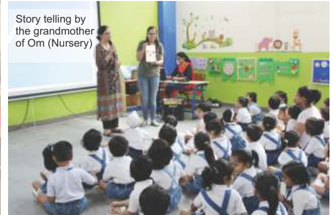
Story telling by the grandmother of Om (Nursery)