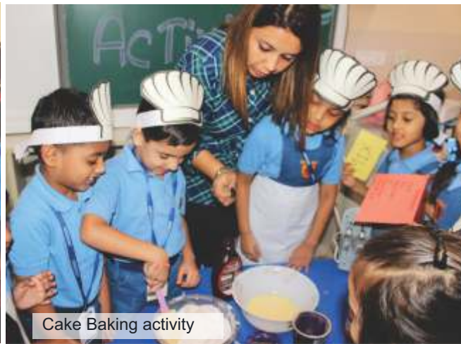
Cake Baking activity