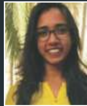
Nandhika Nambi Teenage Stories