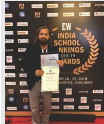
Best School in Zirakpur EW India School Ranking 2018-19

The Young India Books Award Programme has been initiated to applaud and recognize the top five schools across the country, for their exemplary work in instilling love for reading in their students. The award is based on the initiatives taken by the school in this direction and the quality of work produced by students after reading the books listed in the competition.