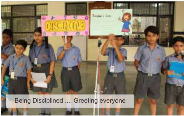
Being Disciplined .... Greeting everyone

Equipping our students with the ability to acquire the skill they need for the rapidly evolving world in which they live