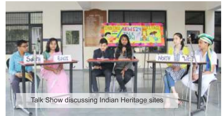
Talk Show discussing Indian Heritage sites