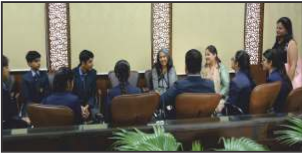
Students interviewing Gayathri Prabhu, author of the book 'If I had to do it again' at CLF 2018.