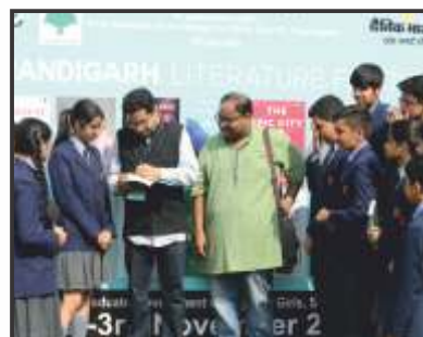
Students interacting with the author of the book "The epic city- the world on the streets of Calcutta" Kushanava Choudhury and the critic Kunal Ray.