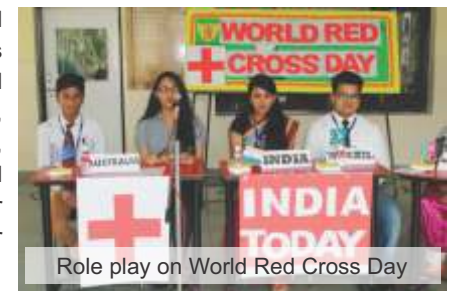
Role play on World Red Cross Day

Morning assembly provides a stage to students where they can share feedback of school programs, their experiential moments, stories and celebrate all special days. All the assembly activities are aimed for life skill development among students. The special assemblies are held from time to time to provide training in social behavior, facilitate moral and religious development, celebrate national days, birthdays of great leaders, poets, scientists, writers. Students are also motivated in school assembly by positive reinforcement in the form of praise or rewards awarded for academic and co-curricular activities.