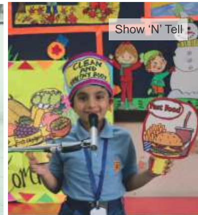
Show 'N' Tell