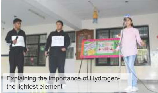
Explaining the importance of Hydrogen- the lightest element