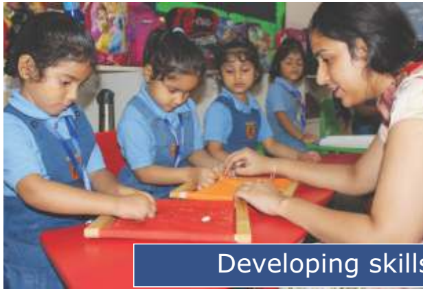
Developing skills to dress up

Early childhood education impacts the success that students experience later in life