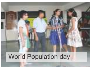
World Population day

Morning assembly provides a stage to students where they can share feedback of school programs, their experiential moments, stories and celebrate all special days. All the assembly activities are aimed for life skill development among students. The special assemblies are held from time to time to provide training in social behavior, facilitate moral and religious development, celebrate national days, birthdays of great leaders, poets, scientists, writers. Students are also motivated in school assembly by positive reinforcement in the form of praise or rewards awarded for academic and co-curricular activities.