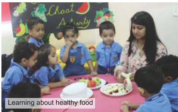
Learning about healthy food