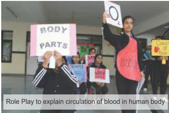
Role Play to explain circulation of blood in human body