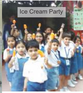
Ice Cream Party