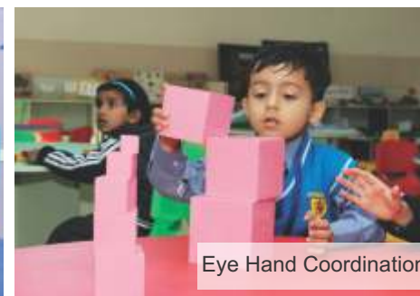
Eye Hand Coordination