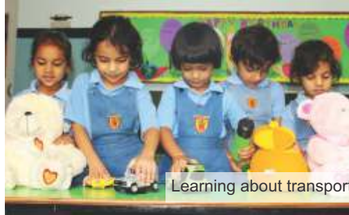
Learning about transport