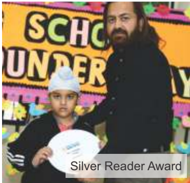
Silver Reader Award