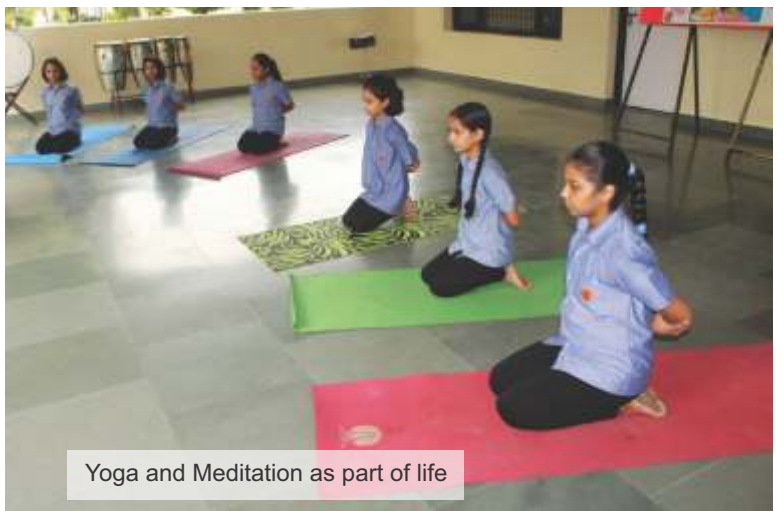
Yoga and Meditation as part of life