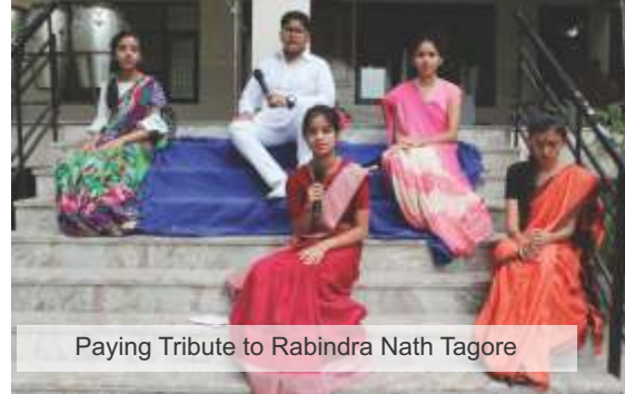
Paying Tribute to Rabindra Nath Tagore