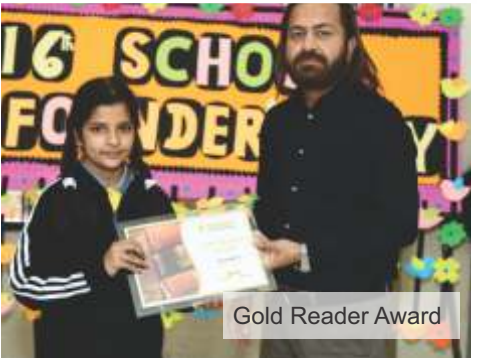
Gold Reader Award