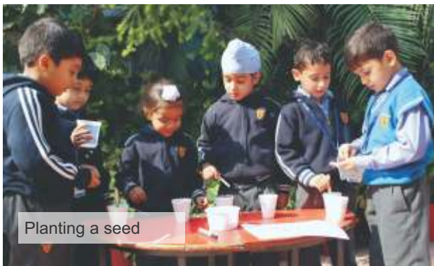
Planting a seed