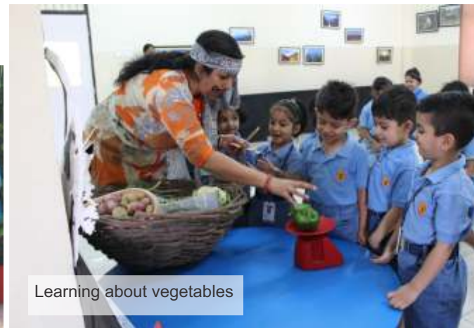
Learning about vegetables